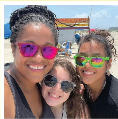
Our cottages went to Galveston as one big family and had a blast swimming in the ocean and playing football on the beach.