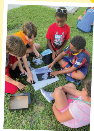
The field trip to NASA Johnson Space Center was an absolute "blast" where kids learned about space exploration and completed astronaut training.