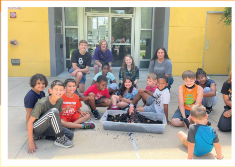
Our awesome tutors helped the kids build a volcano as an educational and fun activity in our BGC summer program.

Summer is always a special and fun time at BGC, and summer 2021 was one for the books. Thanks to the support of individuals, businesses and organizations, the kids at BGC had opportunities to participate in fun and educational activities and field trips along with service projects. The photos below illustrate some of the great fun had by all this summer.