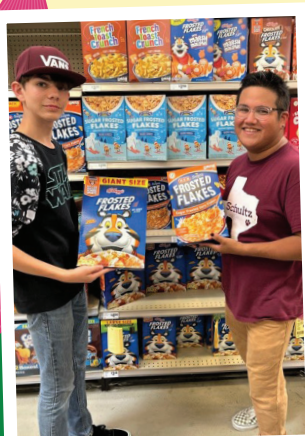
BGC held an Amazing Race this summer to help kids prepare for becoming self-sustaining and contributing adults. The challenges helped the kids to learn life skills including changing a tire, locating important places like urgent care, grocery shopping and learning how to make basic home improvements.