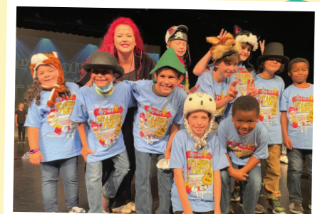
Thanks to our partnership with StageCraft Studios, our kids were blessed with the opportunity to show their talents in a play titled "I Won't Grow Up."