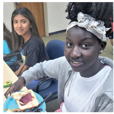
Science experiments are even more fun when they are tasty! Our kids did a peanut butter and jelly excavation experiment that taught them how ancient items end up buried and how archaeologists excavate them.