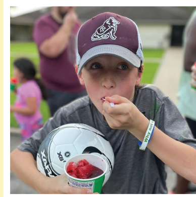
Our kids had an amazing experience at soccer camp with Sports Quest Ministry. They learned new skills while exercising and growing in fellowship. On the last day of the camp, our friends at Sports Quest treated our kids to Kona shaved ice, and everyone enjoyed it!