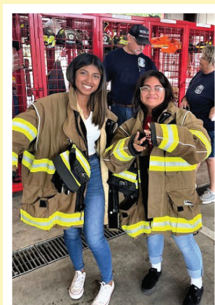
Our kids had the opportunity to visit the Waller Volunteer Fire Department, where they learned all about firefighting, including how to wash a fire truck.