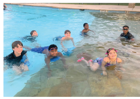
We are blessed at BGC to have a pool on campus where our kids can splash, swim and enjoy the summer sun!