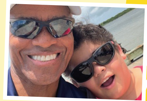
Our kids visited the Ocean Star Offshore Drilling Rig Museum and Education Center, where they saw and learned about a retired drilling rig and offshore energy.