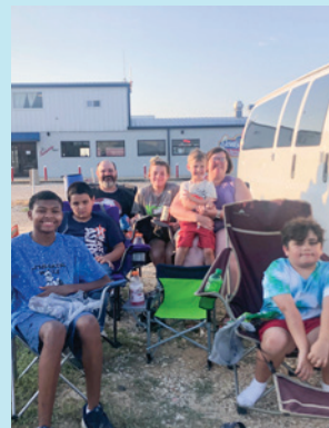
Our Cottage 8 family enjoyed an old school movie night watching Ghostbusters at the Showboat Drive-In.