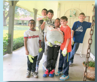
The Cottage 7 boys kept their summer service project close to home by cleaning up and weeding around campus.