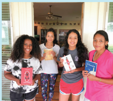
This summer, we were so blessed to have a full library of donated books on campus to fill the endless hours of quarantine.