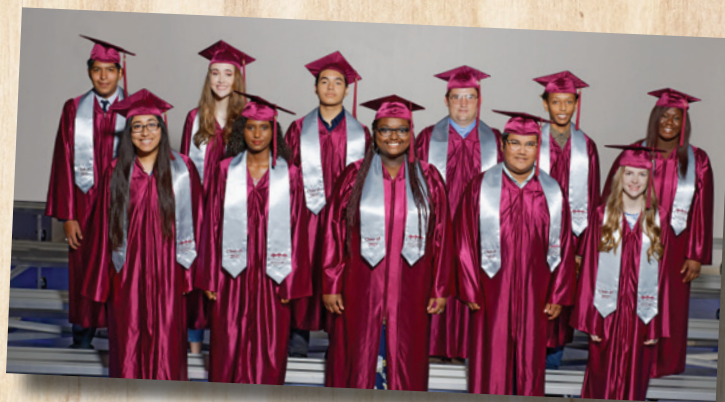
Class of 2021

Because of COVID-19, we made the difficult decision to cancel our annual Spring Festival in May and the Heritage Award Dinner in October; these revenues constitute about 45% of our budget. In their place, we have created the Heritage Campaign, the revenue from which is absolutely critical to the care of our kids.