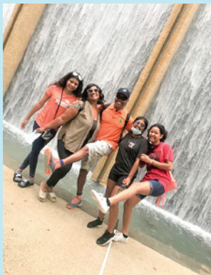
Cottage 3 got creative in keeping their summer outings outdoors. They enjoyed a day at the Gerald D. Hines Waterwall Park!