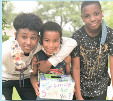
The boys of Cottage 5 made a prayer box so they could battle the COVID-19 blues with prayer!