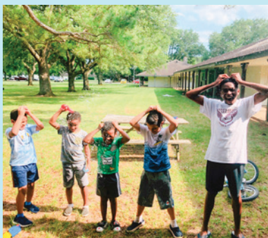
Cottage 5 and 6 guys beat the heat with a good old-fashioned water balloon competition!