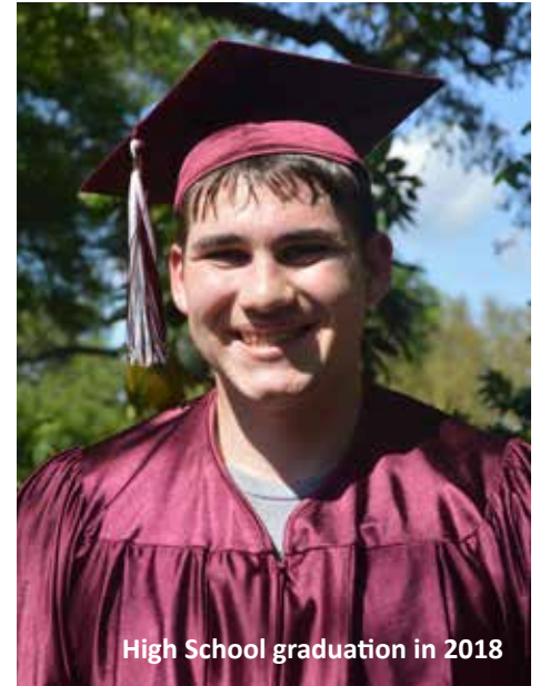
High School graduation in 2018

Thank you for helping children in need to have not just what they need now but what they need in the future as well. Your support touches the lives of many.