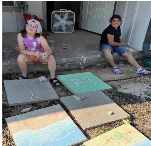
Our girls celebrate creativity, friendship and the joy of simple summer pleasures. Chalk on!