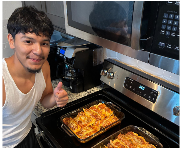
From the kitchen to the heart—our kids took cooking lessons that helped them find responsibility, pride and the joy of serving others.