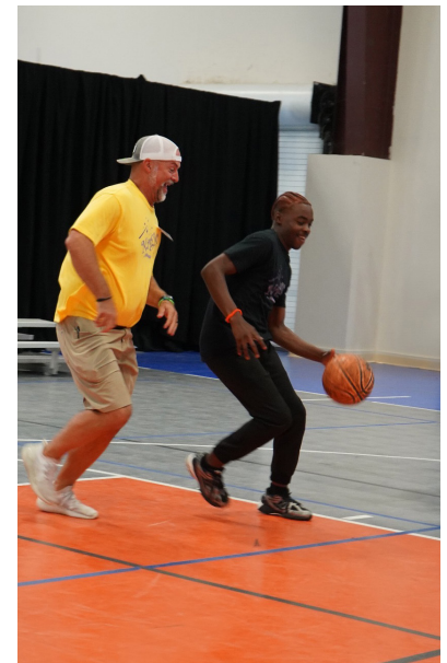
Every game is a chance to build trust, confidence and connection. TBRI camp in action!