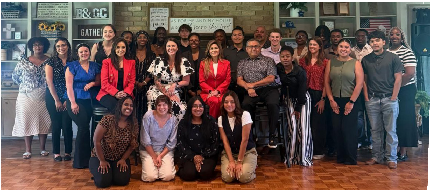
Guest speakers with our College and Career students

clear vision of life in the College and Career Program. For current college students, it was a reminder that they are supported by mentors and peers who believe in their potential.