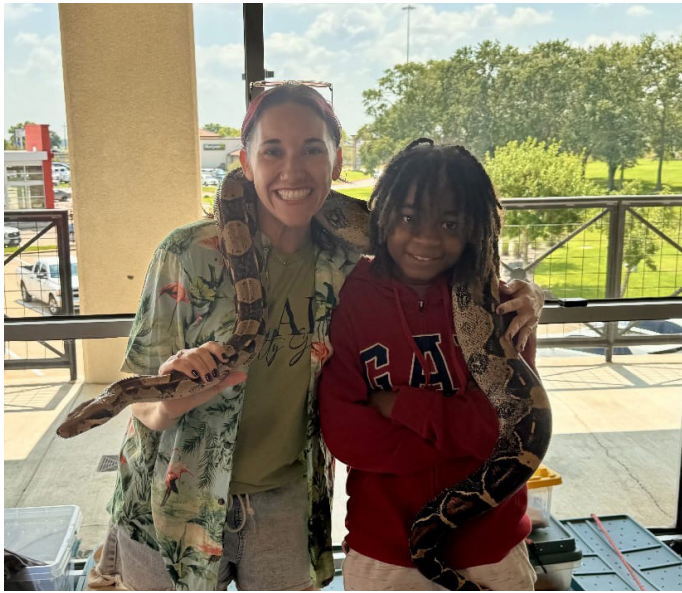
Discovery comes in unexpected forms—our kids learned about nature, respect and curiosity this summer.