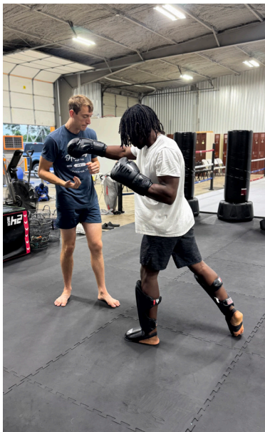
Discipline, focus and a whole lot of courage—our kids embraced a new adventure, Muay Thai style at Heritage Muay Thai!